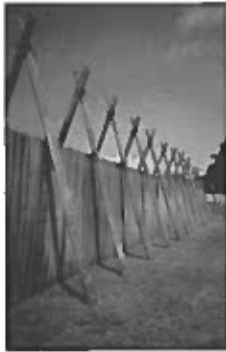
Rebuilt palisade at Fort Caroline, Florida. Here in 1565, Spanish forces surprised French Huguenots in their sleep, killing 130 of them.