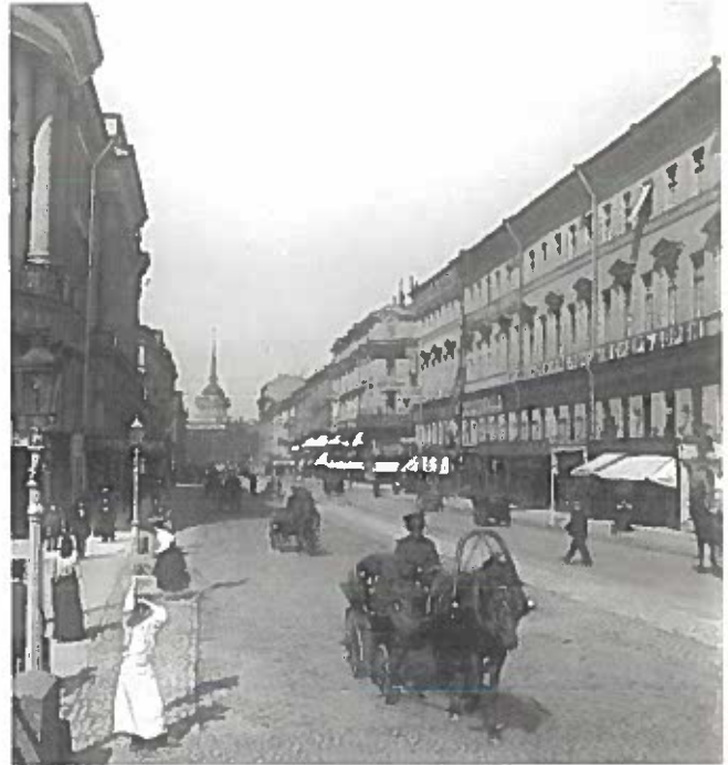
Nevsky Prospect at the turn of the century.

cultural image, popular entertainment and its critics, practices of and anxieties about urban night life (from decadent cabarets to murder), religion and spirituality, and the avant-garde. My sources are primarily newspapers and magazines, memoirs and correspondence, and literature and other forms of artistic expression. A diversity of intellectual themes lie at the heart of the project. Above all, the focus is on the problem of modernity—the contradictory and unstable dialogue between contingency and its repressive denial, between faith in progress and deep unease—and of the city of St. Petersburg as a vital and ambiguous modern site and as a symbol of a conflicted national culture. Other themes also loom large, however, such as cultural values and ethics, self and identity, religion and the sacred, memory and nostalgia, cultural optimism and pessimism.